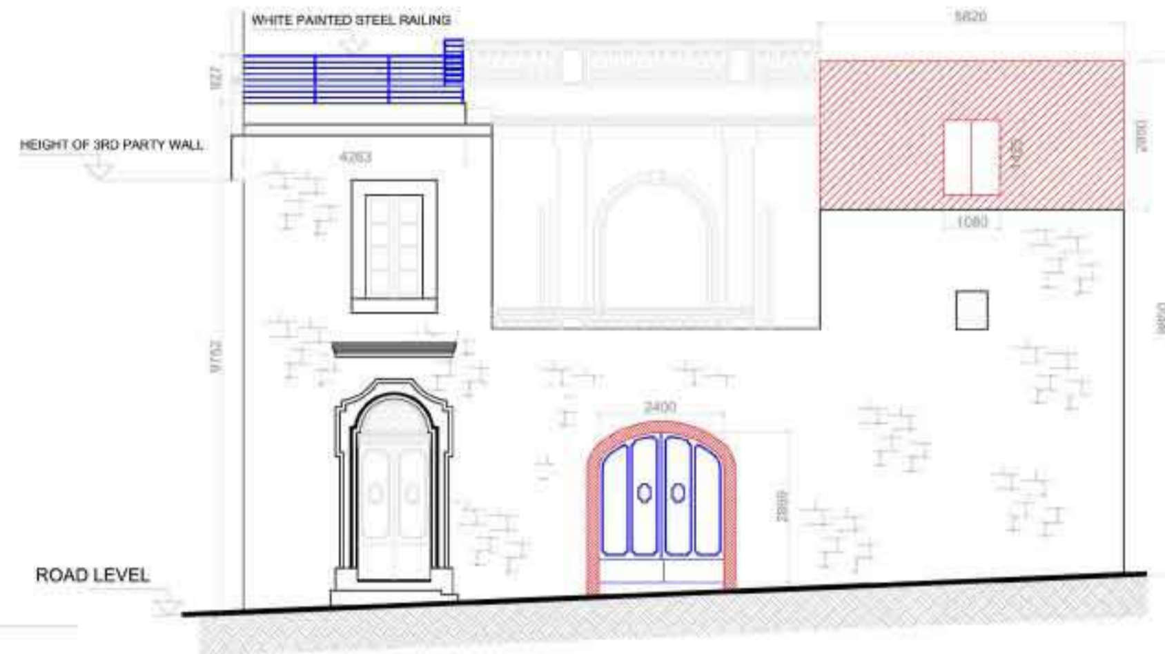
9 PROPOSED ELEVATION E3 Scale 1:100