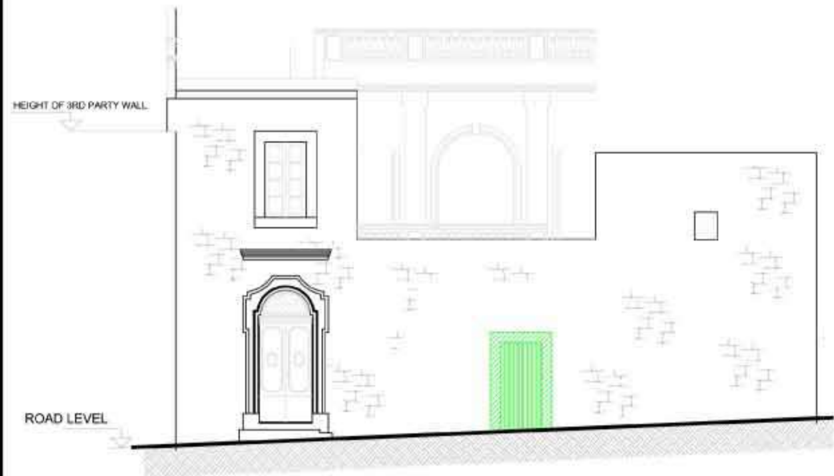
7 APPROVED ELEVATION E1 Scale 1:100