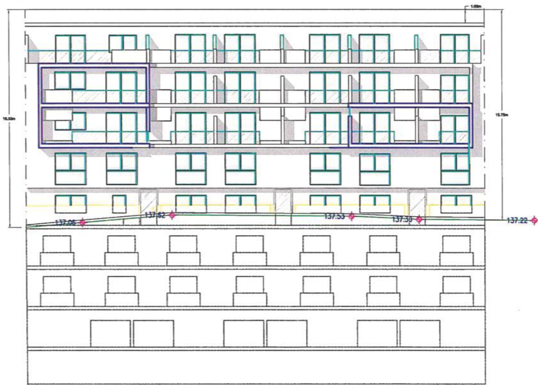
PROPOSED ELEVATION - scale 1:100