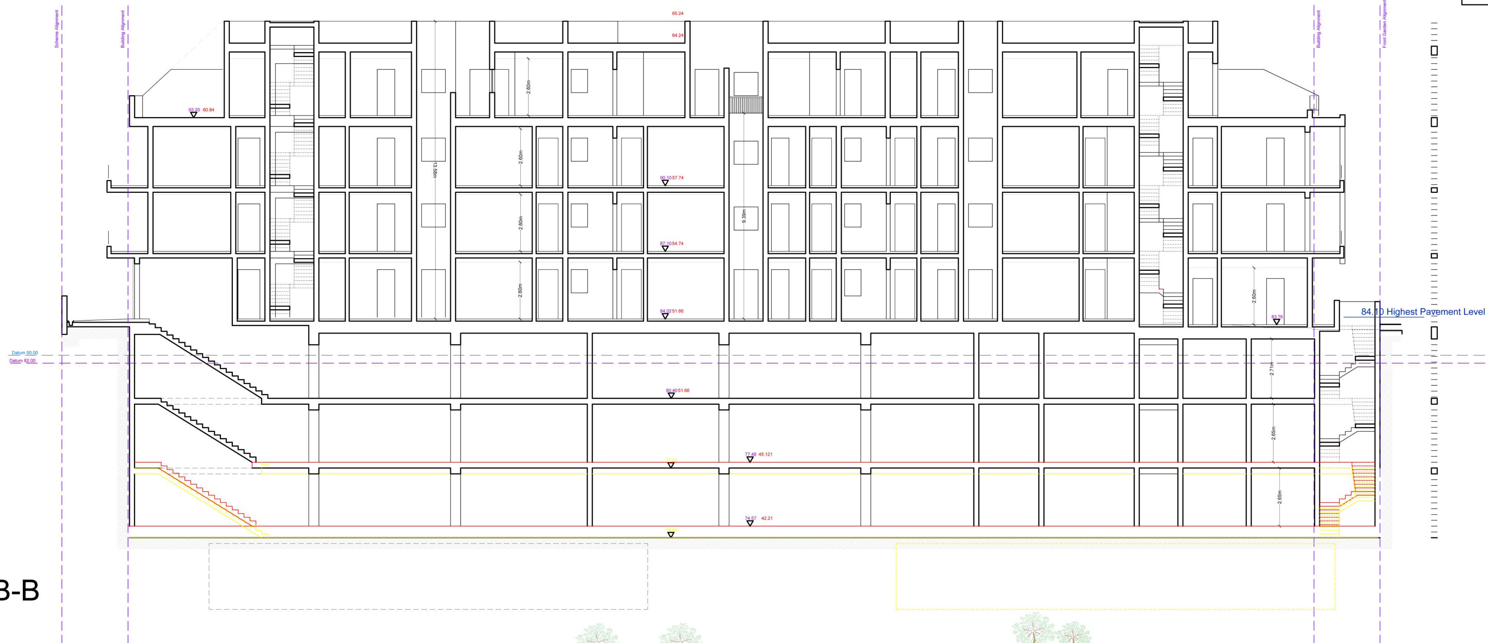
Section B-B Scale 1:100