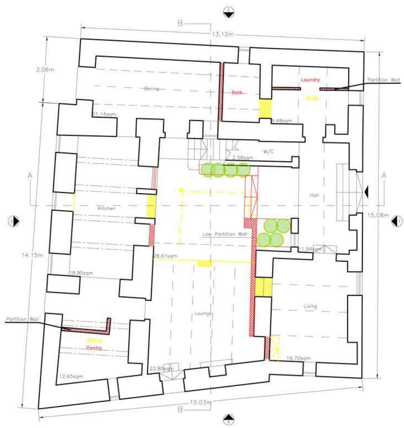
Ground Floor Level Approved/Proposed Scale 1:100