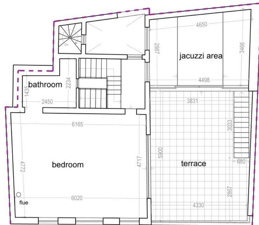
Second floor plan